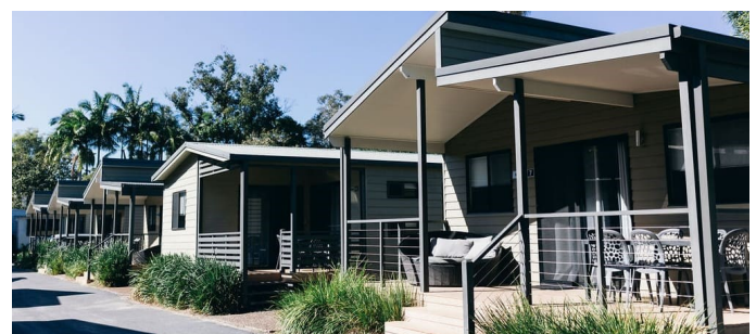
Camp Kitchen and common area within the Big 4 Tweed Billabong Tourist Park (Rally Headquarters) One of the recommended tourist park properties