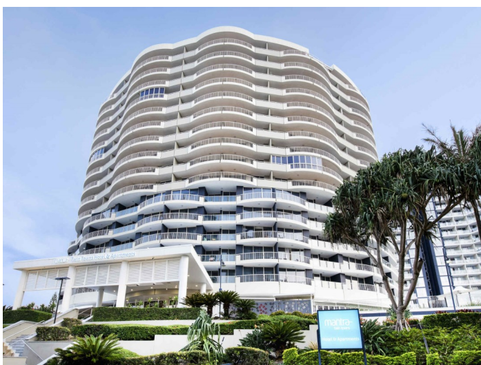
Sebel Mantra Twin Towns Apartments Recommended accommodation for overseas entrants without a veteran vehicle.