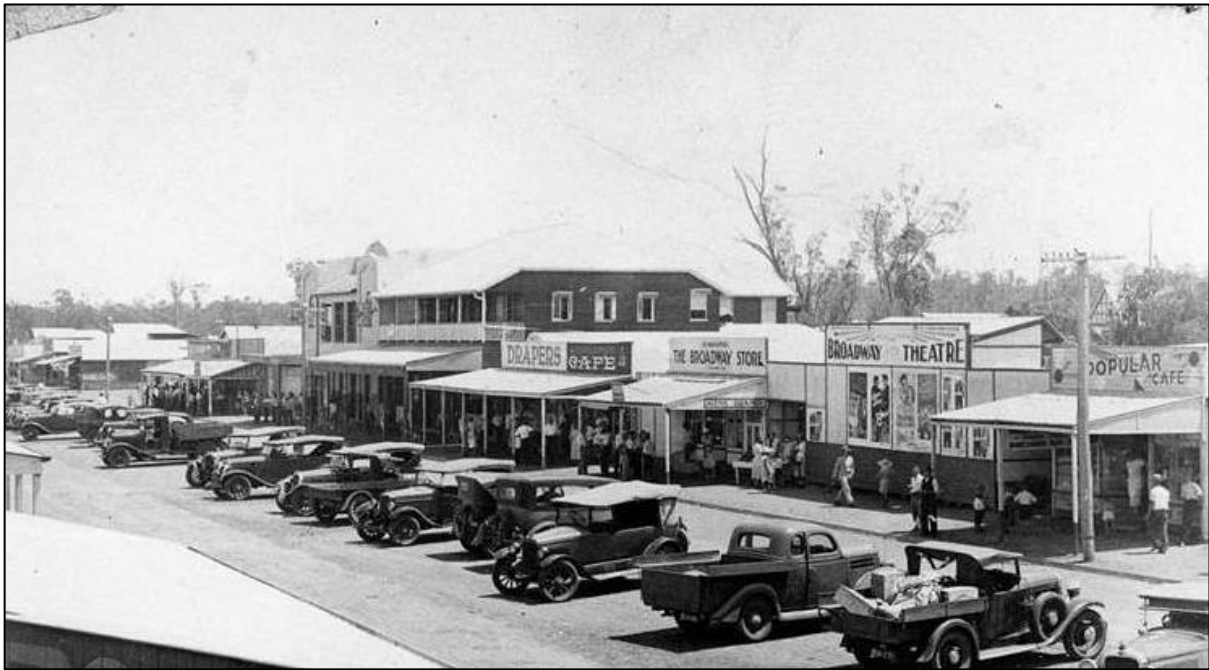
Callide Street, ca 1936

Biloela is in the Banana Shire. The shire was named after the first township in the region (Banana), which in turn was named for the burial site of a huge dun coloured bullock named 'Banana'. - Now you know!