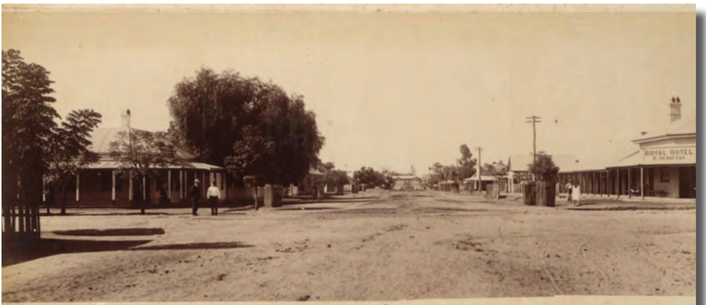
Charleville, cnr Wills and Alfred Streets circa 1906. One of the last photos of Charleville before the first car, a De Dion, came to the district.

We are looking to add visits to both of these into the rally program in 2021.