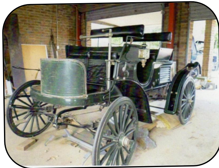
1899 Thompson – Is this the oldest vehicle in the Club? See inside