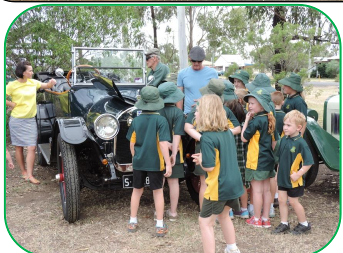
Jimbour School inspecting the vehicles