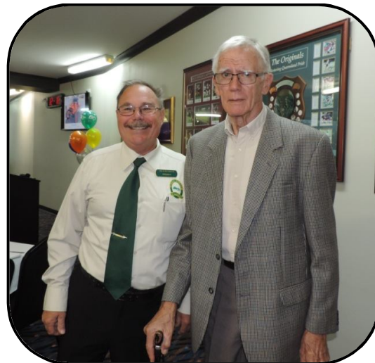
President and Past-President