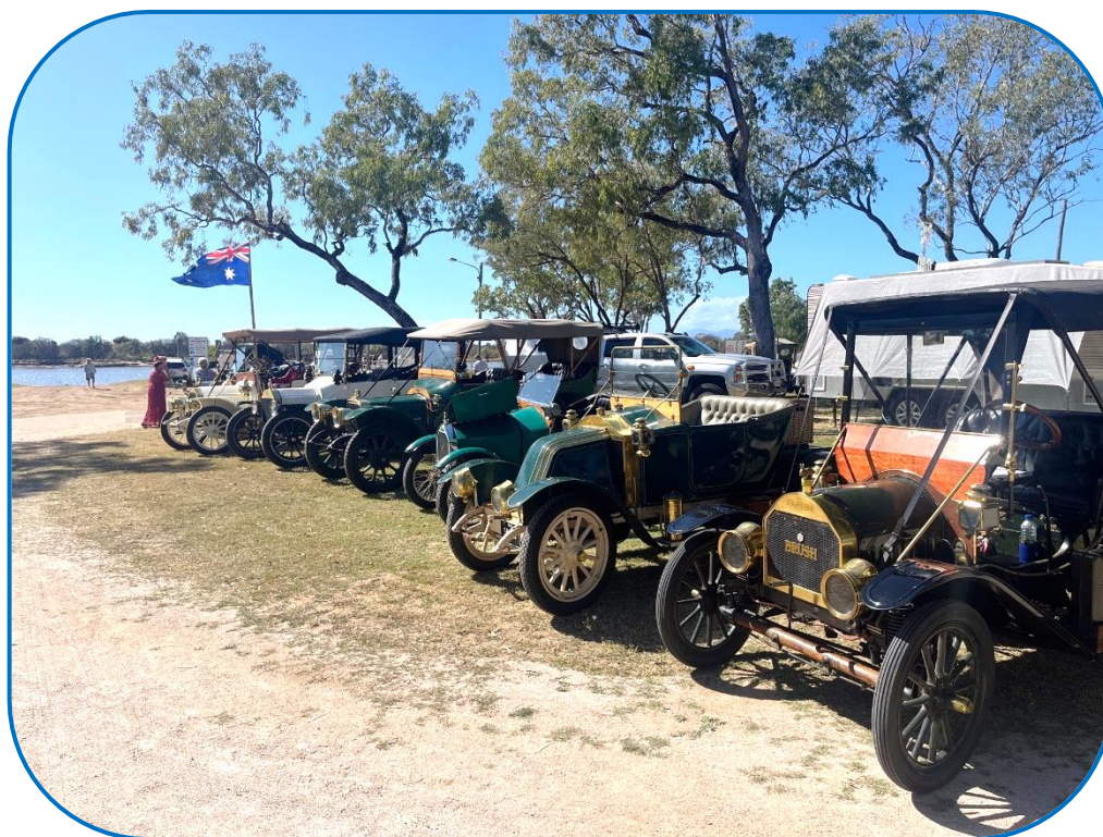
Groper Creek Morning Tea Stop, on the Northern Tour