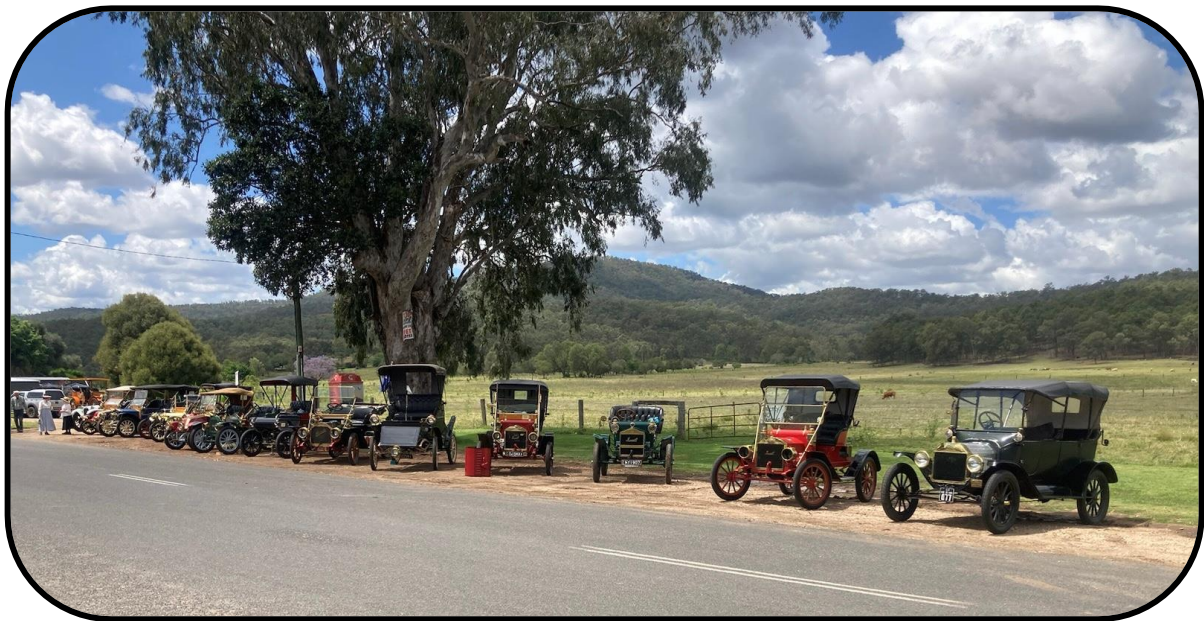
Cars at Friday lunch stop – Creepy Crawly Rally