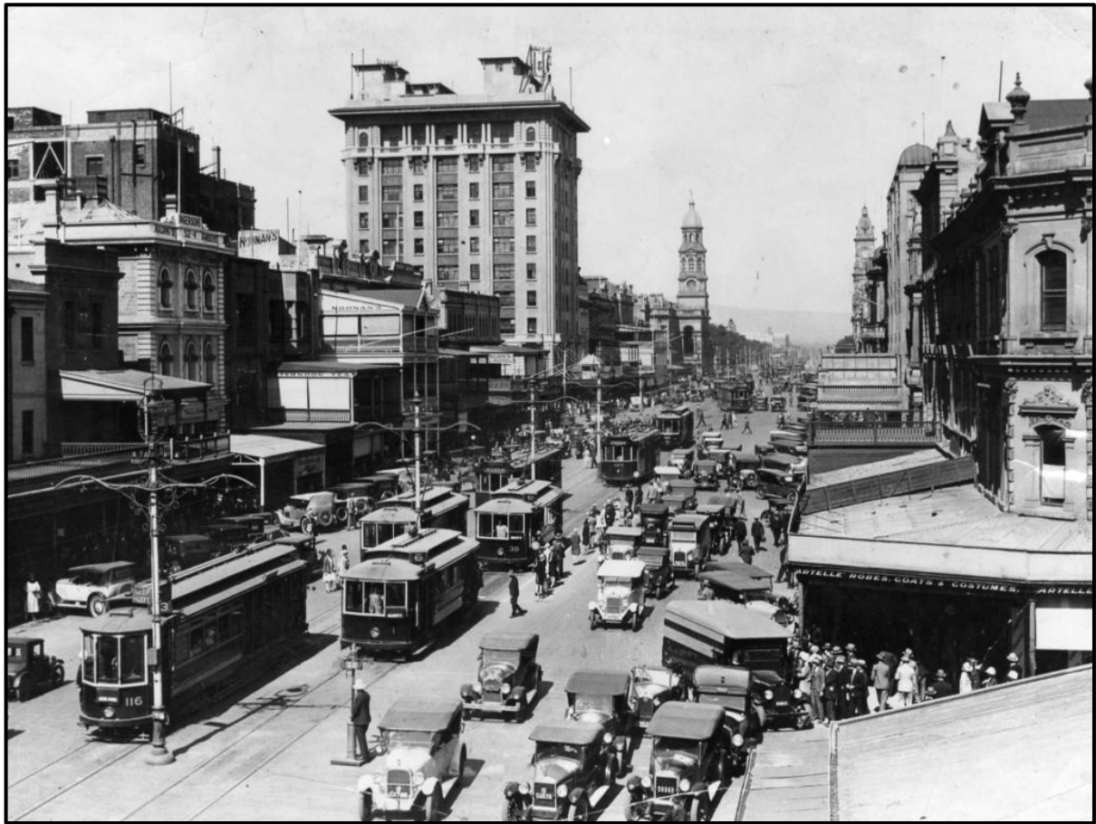
Adelaide 1925. In the foreground is a white Dodge, an Essex roadster and an Essex tourer. Behind them is a Buick, a Maxwell and possibly a Fiat.