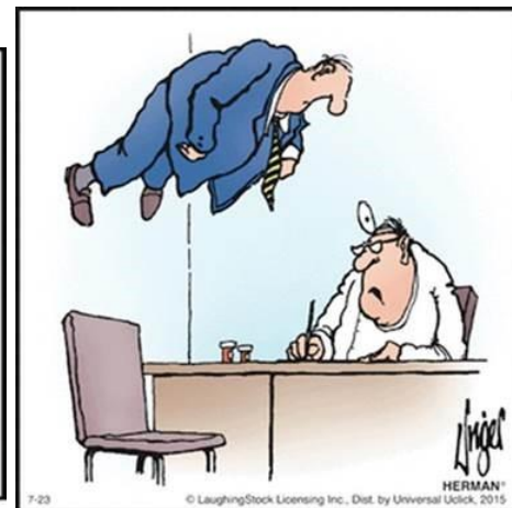
"I'll give you something for gas."