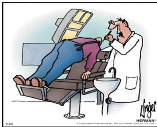
"Try to relax."