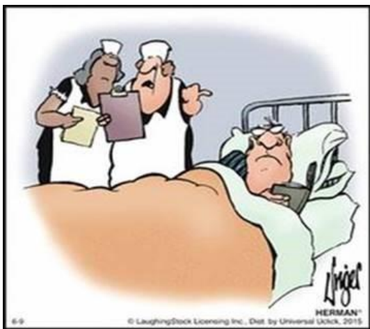
"Butcher Harris is doing this one tomorrow morning."