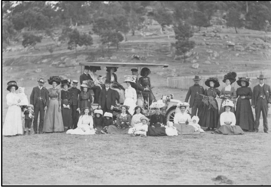
The townsfolk with the First Car in Wollombi - an early Renault.