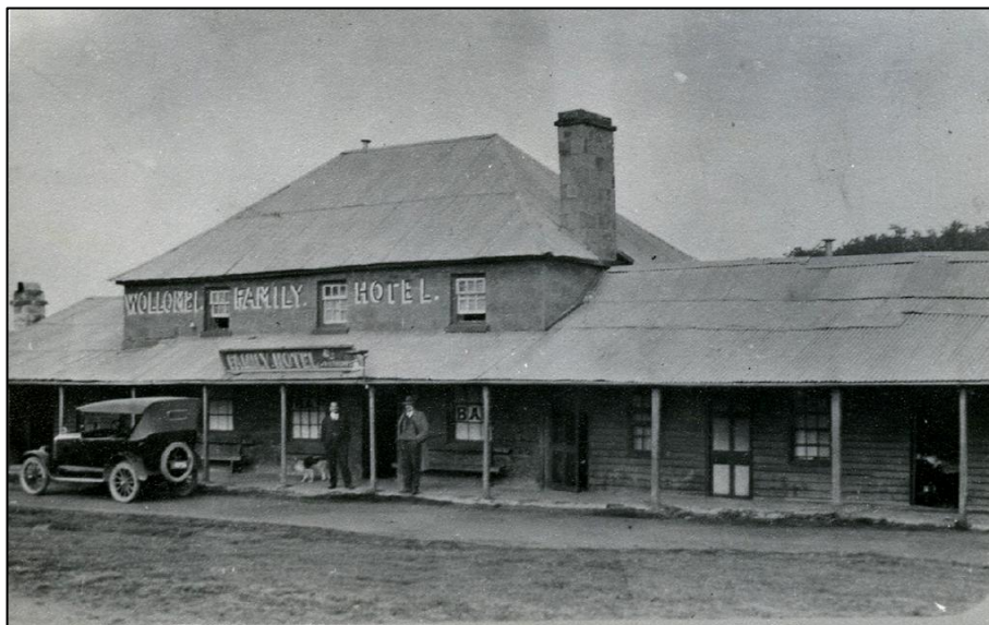
The Wollombi Family Hotel.