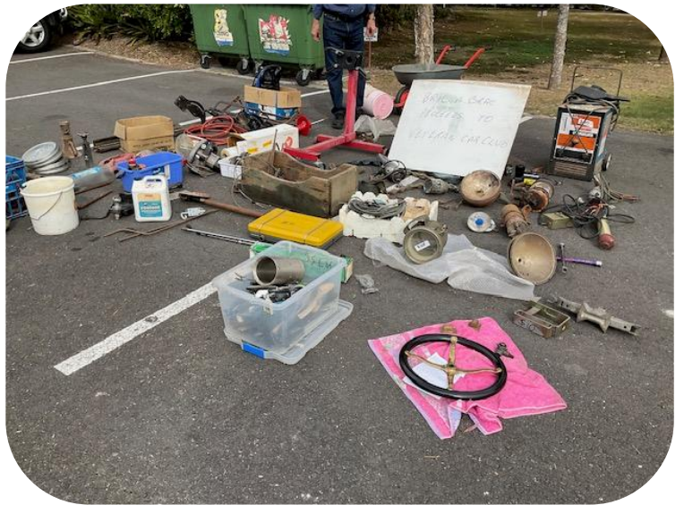
At the end of the Swap