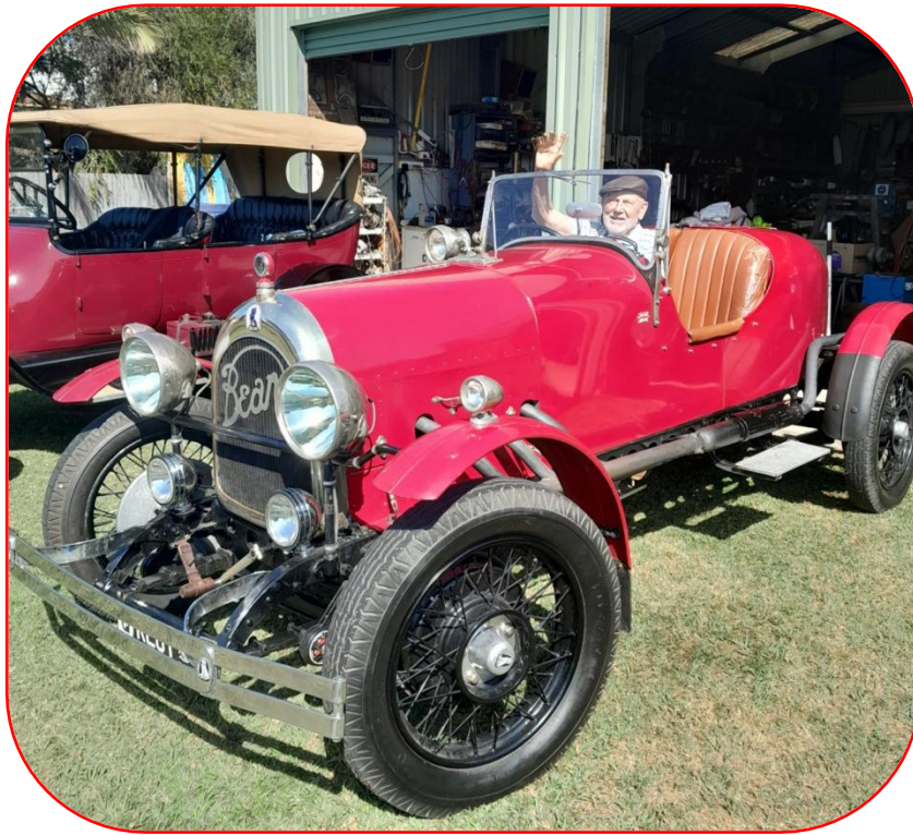
Kevin prepares to take the car for a test drive