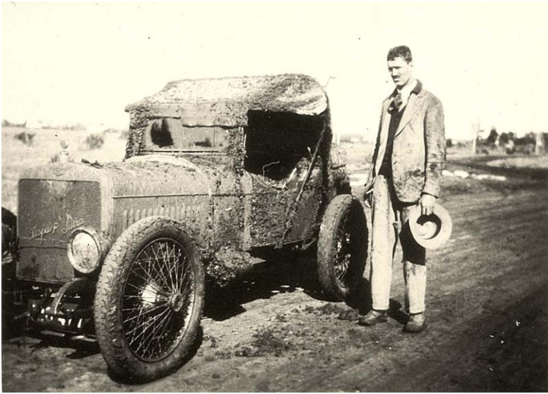
Hispano Suiza in the mud, just outside Griffith.