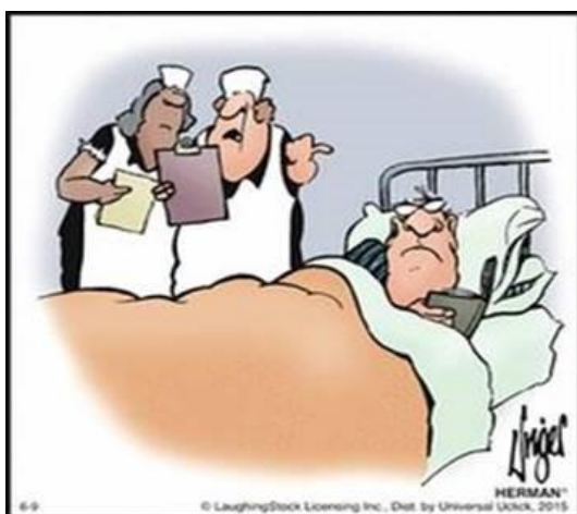
"Butcher Harris is doing this one tomorrow morning."