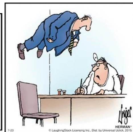
"I'll give you something for gas."